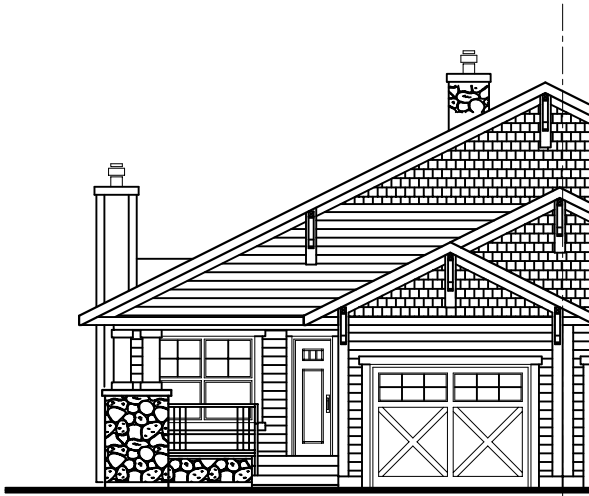
○ BENNINGTON FRONT ELEVATION